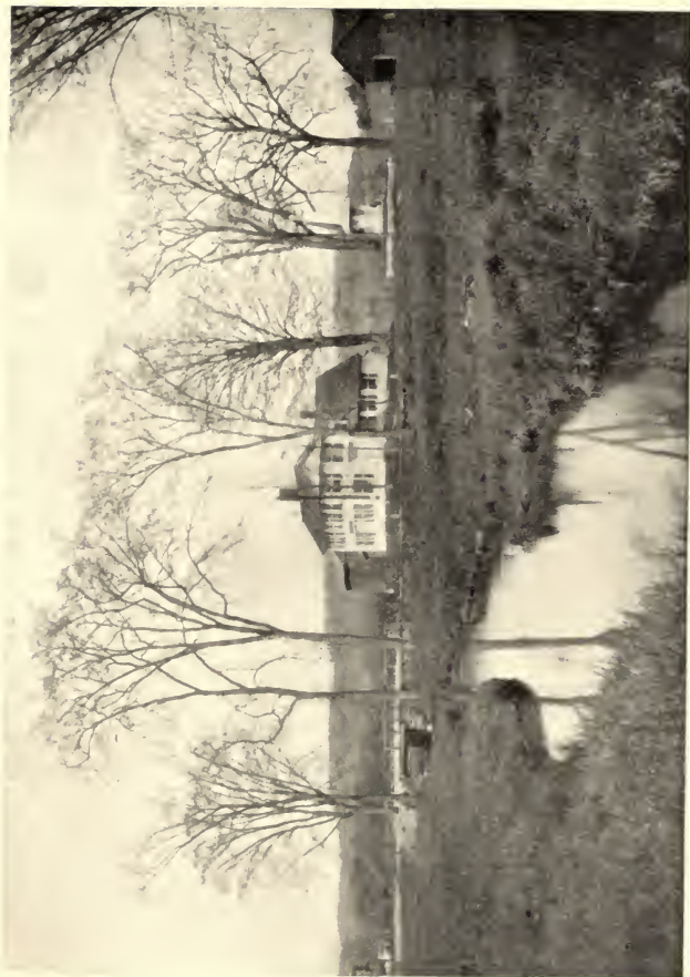
BLOODY BROOK, SOUTH DEERFIELD, MASSACHUSETTS